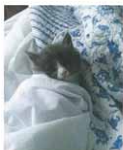
Tilly and me